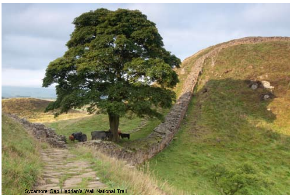
Sycamore Gap Hadrian's Wall National Trail

Next month we will introduce you to the local delivery officers!